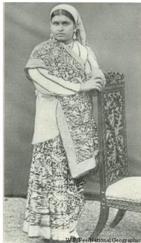
Parsi Lady in Regulation Dress